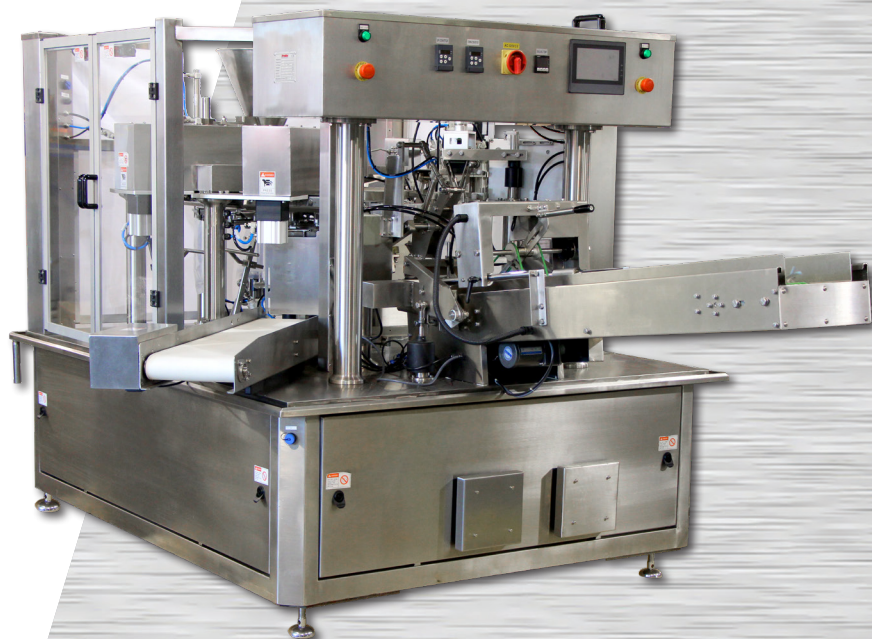
RBF8-XL Automatic Rotary Bag Filling & Sealing Machine for Larger Portions