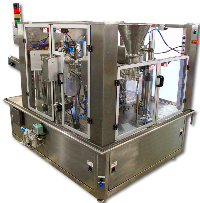
RBF8 Automatic Rotary Bag Filling & Sealing Machine